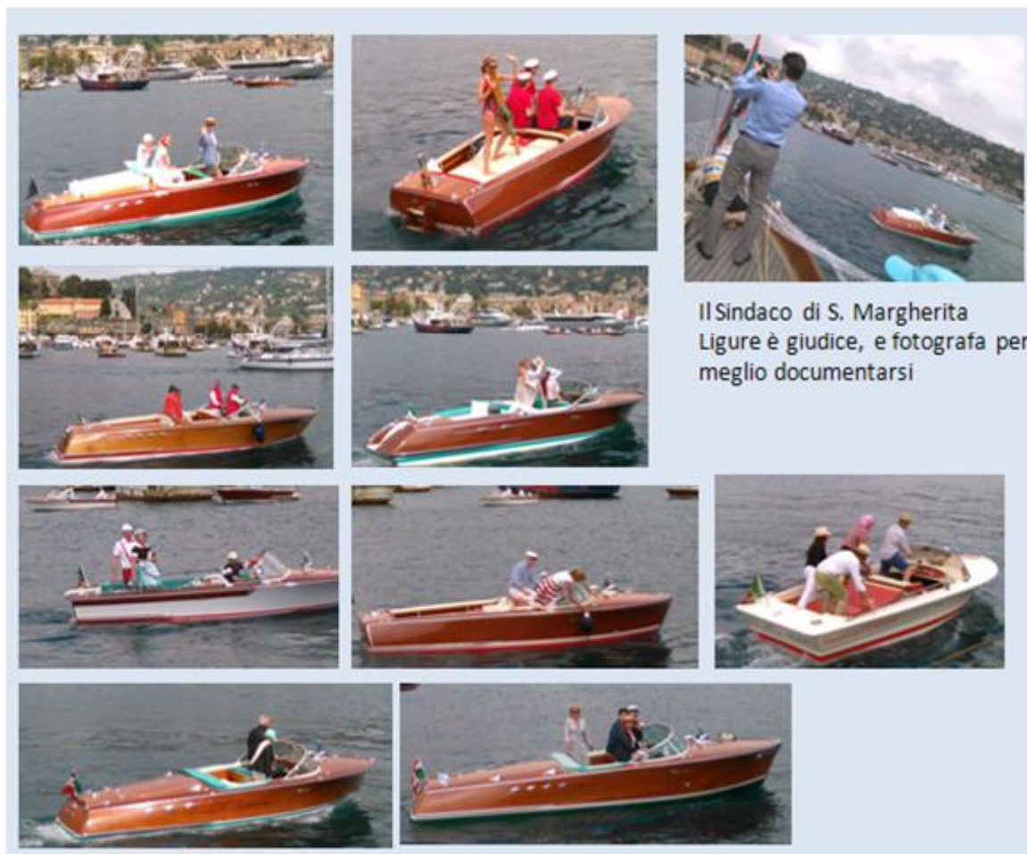
Il Sindaco di S. Margherita Ligure è giudice, e fotografa per meglio documentarsi