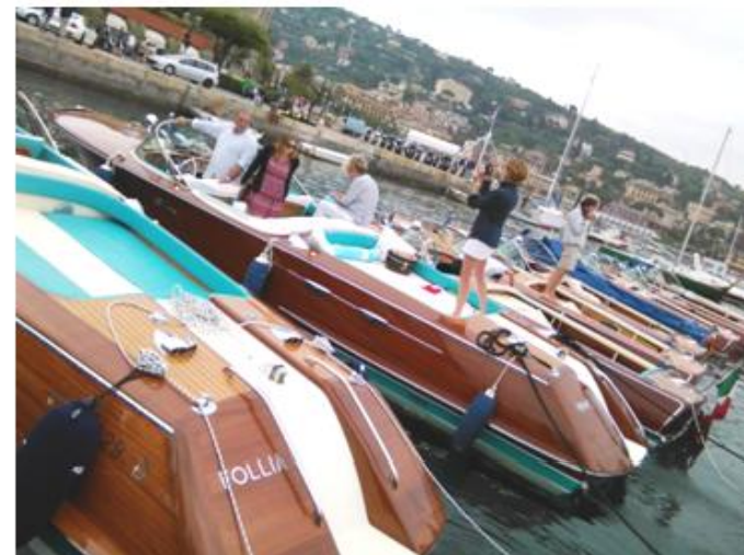
Immagini dell'edizione 2015

Also 2017 Tribute is under the patronage of "Riva Historical Society" and "Riva Society Italia" Associations, promoting it among their members.