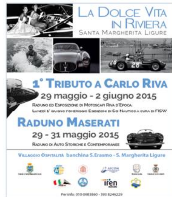
Advertising su "Milano Finanza"