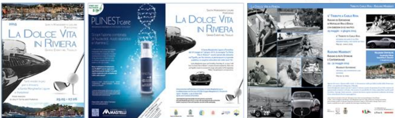
Advertising on page (distribuzione Tigullio)