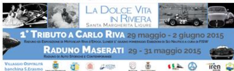
Advertising su "Il Secolo XIX - La Repubblica Genova"