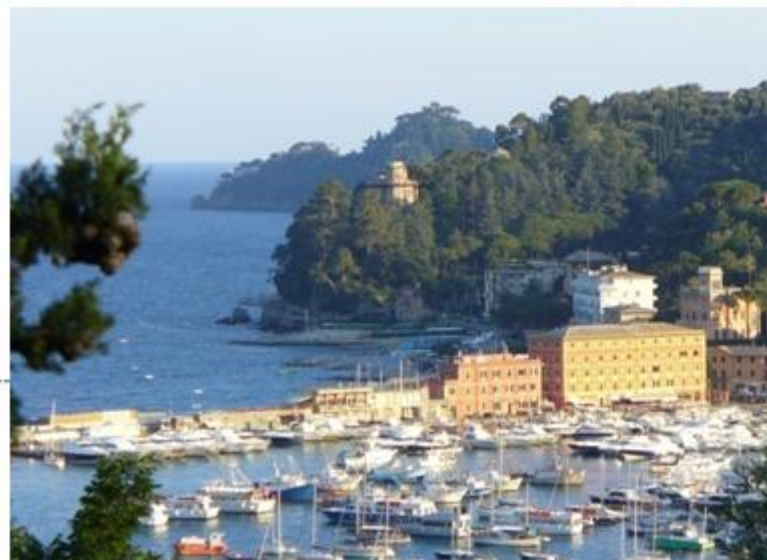
Villaggio Ospitalità: Calata del Porto