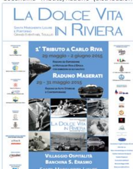
Locandina "Tributo/Raduno (distribuzione locale)