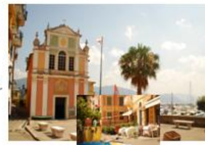
Piazzetta S. Erasmo